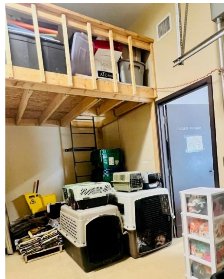
A pup wakes up after surgery in a make-shift recovery room in the GTHS garage.