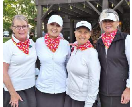
The Lowe foursome.