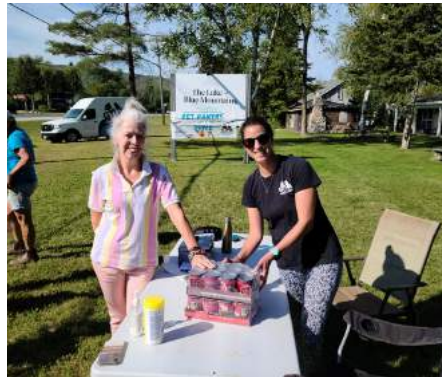
Accepting donations at the Lake.