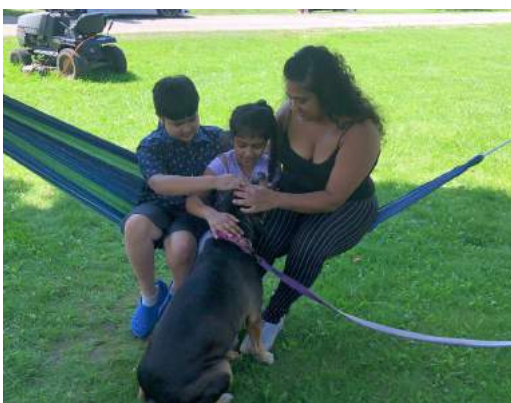
A local family with their beloved dog.