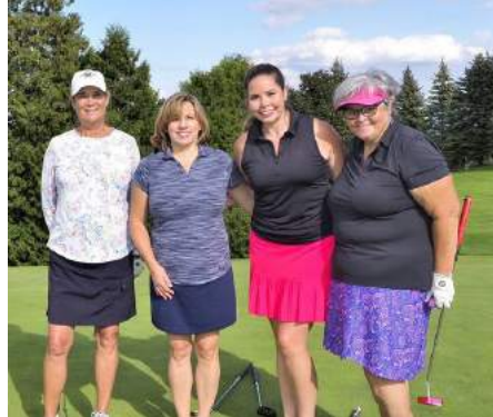
The DeGroot foursome.